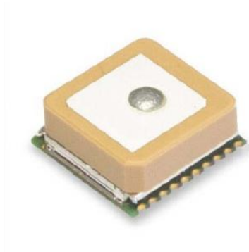
< Smart GPS Module Photo >